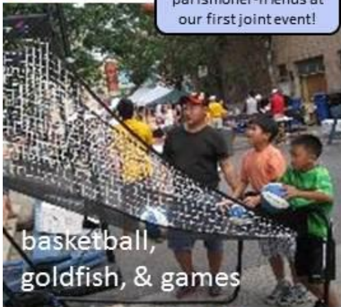
basketball, goldfish, & games