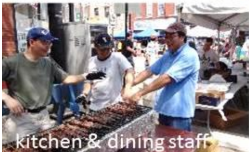
kitchen & dining staff