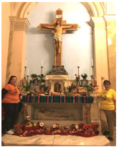
Update on Renew My Church

As you may recall, the Renew My Church process started in February 2018 with eight parishes and six schools in our Bridgeport/Canaryville/Chinatown grouping, including All Saints-Saint Anthony, St. Barbara, St. Jerome, St. Mary of Perpetual Help, St. Gabriel, Nativity of Our Lord, Santa Lucia, and Bridgeport Catholic Academy. Each parish sent representatives to meetings in these past months to discuss, create, and explore different scenarios in conjunction with the Archdiocese of Chicago. The goal of these scenarios is to determine the arrangement of church resources that will best serve everyone.