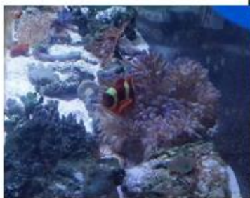
Fresh and Salt Water Fish & Supplies