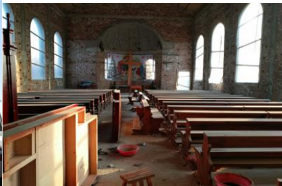
Inside Church (photos –January 2018)