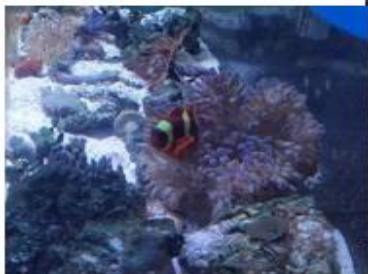
Fresh and Salt Water Fish & Supplies