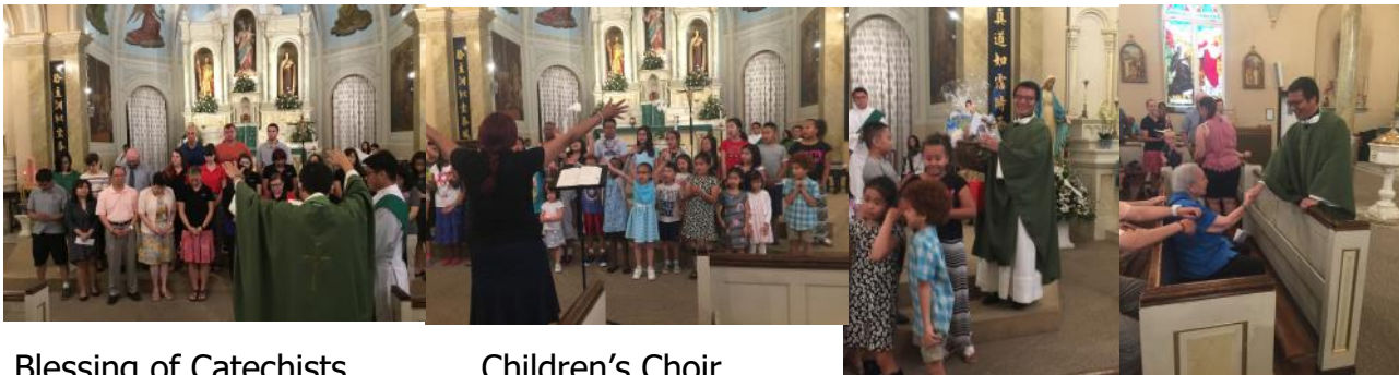
Blessing of Catechists and Teachers