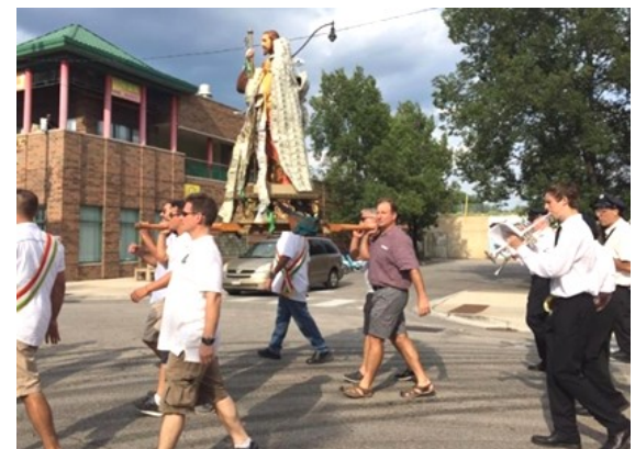
St. Rocco Procession